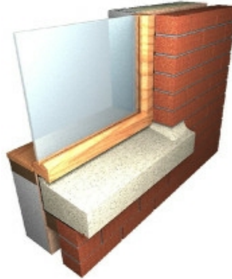
Section Detail by In Granite Recon Timber Wall Construction with Brick Outer Leaf using 140mm Stooled Sill